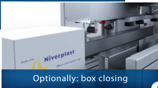
Optionally: box closing